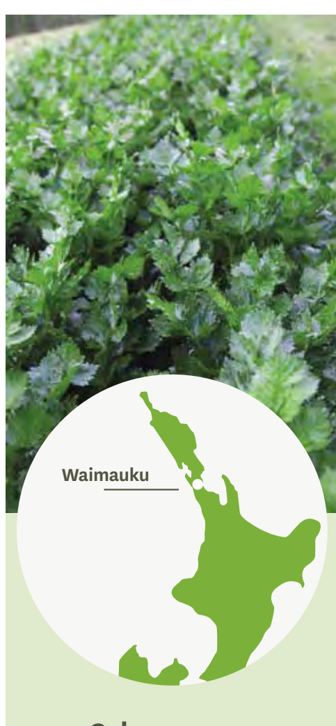
Celery grown across 30 Acres

From humble beginnings in 1906, to the flourishing celery growers we see today, Franklin Farm has always been a dedicated, family operated business.