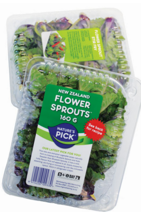
Flower Sprout product, Recipe and Packaging.

Members of this team include individuals with experience in plant breeding, trialing and production; in depth knowledge of fresh fruit and vegetable in the wholesale and retail sector; and extensive marketing and branding experience.